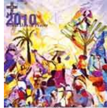
Let Everything That Has Breath Praise God